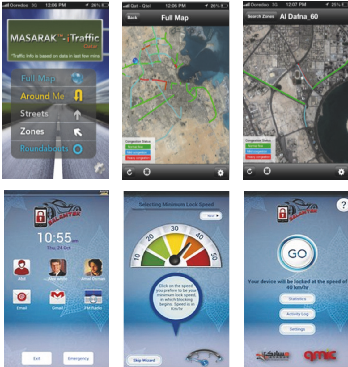
FIGURE 1: Screenshots of iTraffic (top) and Salamtek (bottom) [6].

shown (via a demonstration) how to operate the applications. A group of interviewers was trained to present a demo of the two applications. The interviewers showed the demo of the first smartphone application, explained its advantages, and answered any questions the participants had. These steps were repeated for the second application. In the third phase, the participants were provided with the questionnaire form. The interviewers explained the form to each participant in person. The participants were asked to complete the form by hand and return them then and there. The participants were allowed to ask any questions during the process if any parts of the form were not clear. The minimum sample size required for the study was calculated as follows: