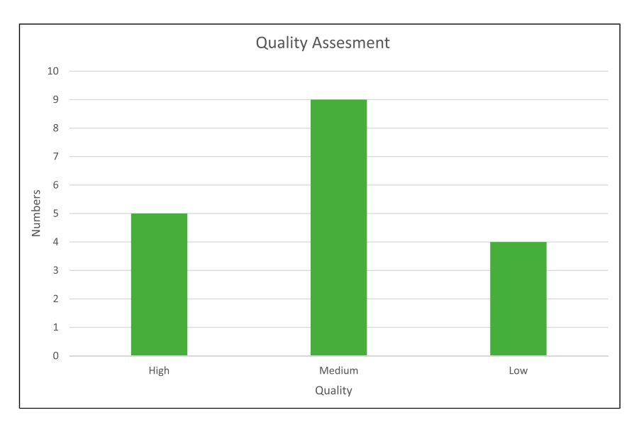
Figure 2. Quality assessment of included articles (Newcastle–Ottawa Scale) demonstrating 5 studies rated high quality, 9 medium, and 4 low quality.