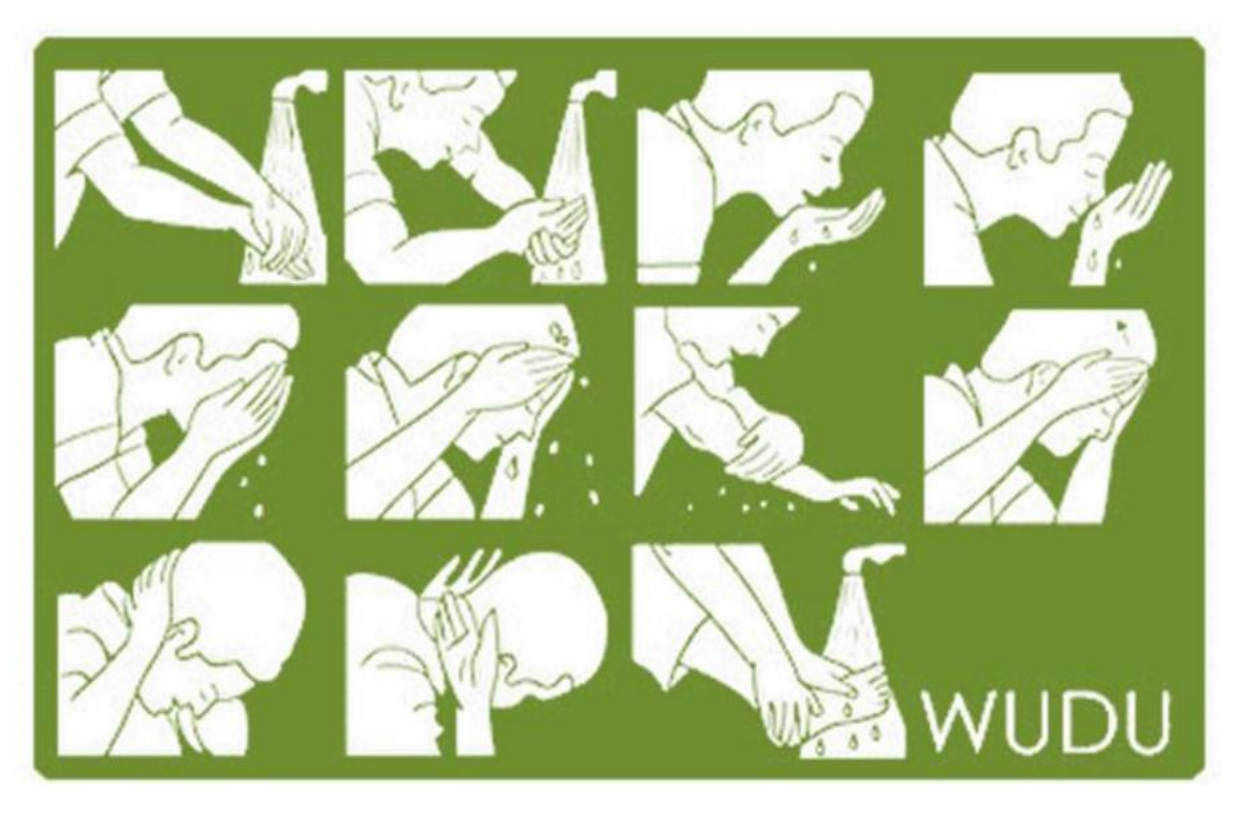
Fig. 1: Steps in the ablution process for prayer (Abu-Rizaiza, 2002)