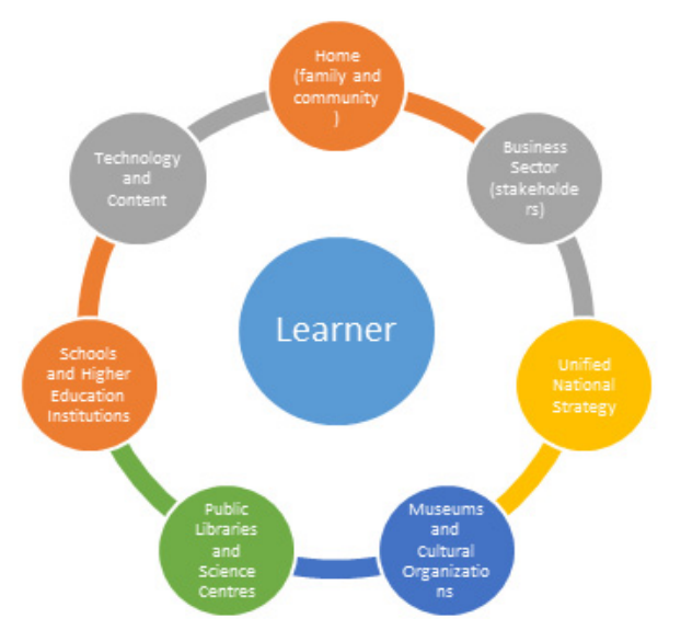
Fig. 1. The components of a learning ecosystem

Qatar Foundation, Community College of Qatar, although not at schools. Thus, in line with Bandyopadhyay, Bardhan and Dey's description of education as a social process, these institutions emphasize the idea of the education process as a linkage of relationships between different segments (Bandyopadhyay, S., Bardhan, A., Dey, P., Bhattacharyya, S. 2021). These segments are learners, government organizations, teachers, families, the local culture, educational bodies. technologies and materials. Museums in Qatar, too, rethought their educational role and began to focus on these considerations, as one participant in the ecosystem educational approach.