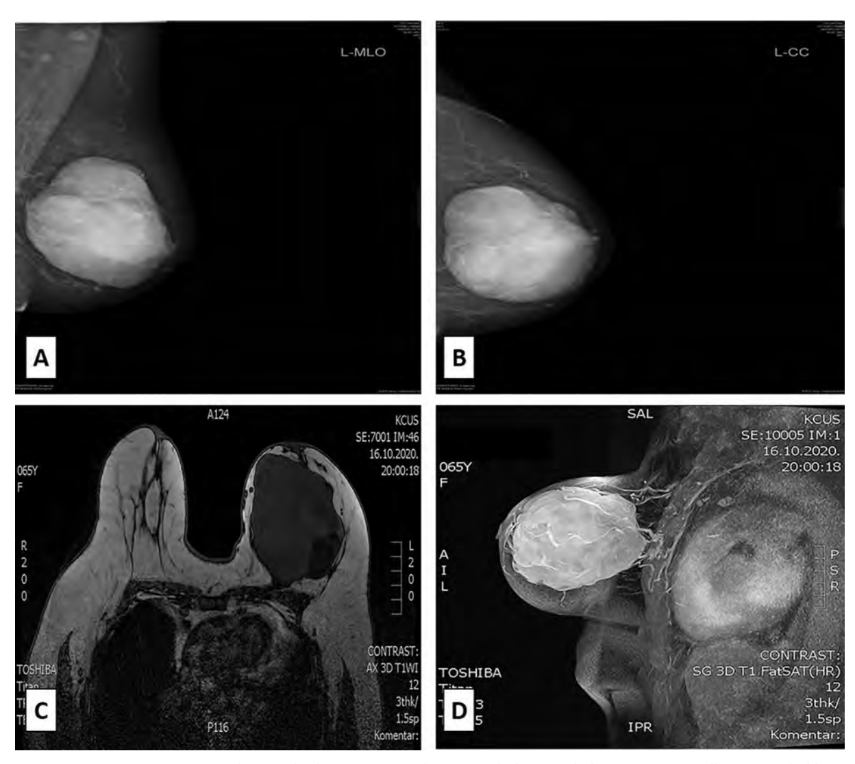
Figure 1A-D. Mammograms on the standard view (MLO and CC) revealed a round, dense mass partially surrounded by a clear halo, without any calcifications (A-B); Axial T1W1 MRI scans revealed a hypointense mass with some hyperintense foci of hemorrhage (C); Sagittal post-gadolinium subtraction image also showed intense enhancement (D).