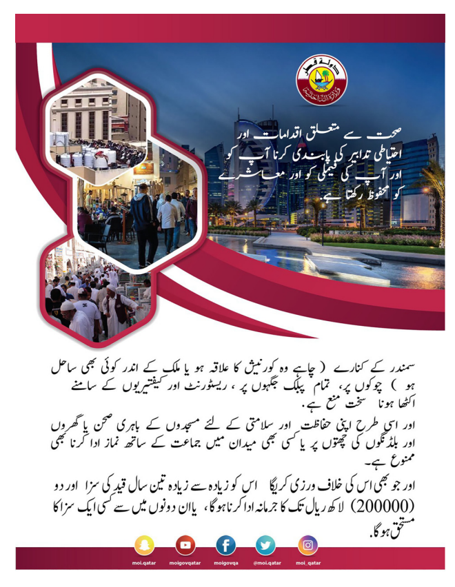
Figure 3: Social gathering prohibition pamphlet in Urdu.

This in many ways was a turning point in the way the government communicated with its migrant population. It realized that, in addition to use of migrant languages, the community leaders could play a critical role not only in delivering health-related information to their people but also creating trust needed for strict