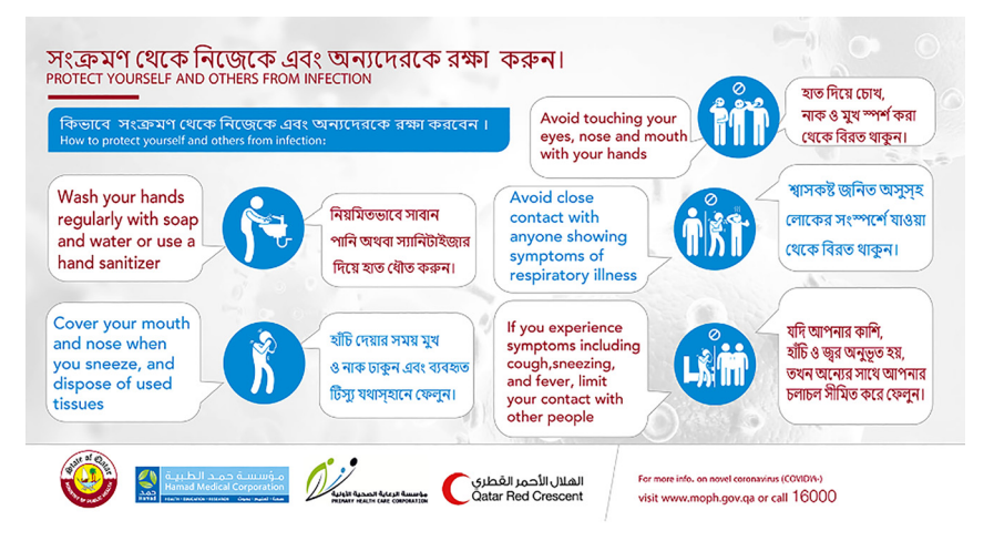
Figure 1: Bilingual COVID-19 awareness pamphlet (Bengali and English).

Since COVID-19 also impacted people's mental health, especially after the implementation of the social distancing law, HMC health professionals released videos in Urdu, Hindi, Malayalam, and Tagalog, in addition to Arabic and English, raising awareness about the mental health issues and the available help at HMC. The fact that these video messages were not released in other languages such as Nepali, Tamil, Bengali, and Sinhalese may have to do with the fact that Urdu and Hindi serve as a lingua franca between speakers of other languages not only in Qatar, but the GCC in general (Ahmad 2019). In terms of the use of migrant languages were used on social media. In Table 3 we provide all migrant languages that were used for different messages during the COVID-19 campaign period for print for at