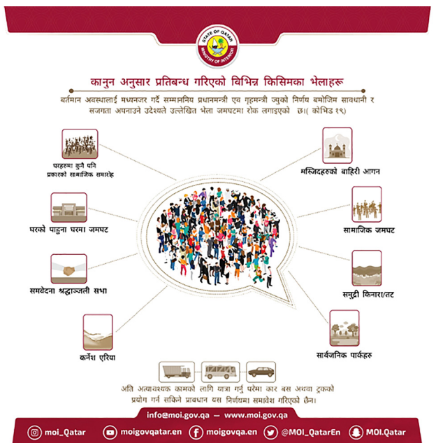
Figure 2: Social gathering prohibition pamphlet in Nepali.

Many newspapers and social media, however, reported and shared videos showing violations of the social distancing instructions from beaches, in front of cafeterias, and Friday congregational prayers on rooftops and open public spaces.