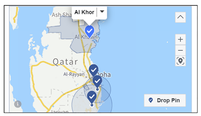
Figure 8: Awareness messages targeting specific locations.

Since Facebook is the most popular social media platform used by Asians in Qatar (Dennis et al. 2019), we examined this platform in greater detail in terms of the number of views of certain COVID-19 health awareness videos. We focused on two video messages—one created by the medical professionals of HMC and the other by the MOI with religious preachers—in Urdu, Nepali and Bengali across FB pages of the relevant ministries and RJ Ubaid Tahir, a social media influencer who also works for Urdu radio FM 107. Table 7 shows that both videos posted on Ubaid Tahir's FB page were viewed by far more people than the MOI and HMC pages. It was not possible to study videos in other languages since neither Ubaid Tahir nor any other social media influencer will post in all languages. The ministries were