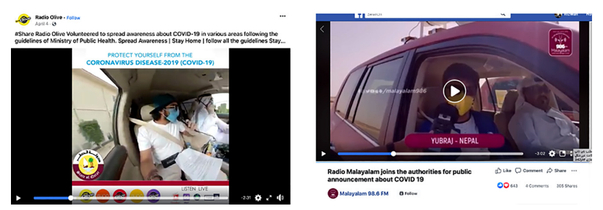
Figure 6: Government partnering with radio olive and FM 98.6.

get information about symptoms of COVID-19, preventions against it, the number of cases in Qatar, and travel advisories in six languages namely Arabic, English, Urdu, Hindi, Nepali, and Malayalam (GCO 2020b). The service was free of charge. Figure 7 shows sample screenshots of the main page of the services showing the available languages in English, and sample information messages about preventive measures in Urdu and Malayalam.