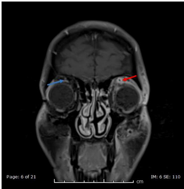
Figure 2. Magnetic resonance imaging T1 post contrast, coronal view showing left sided (red arrow) superior ophthalmic filling defect consistent with venous thrombosis.