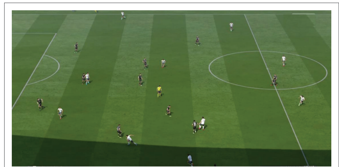
FIGURE 2 | Example of display during the match.