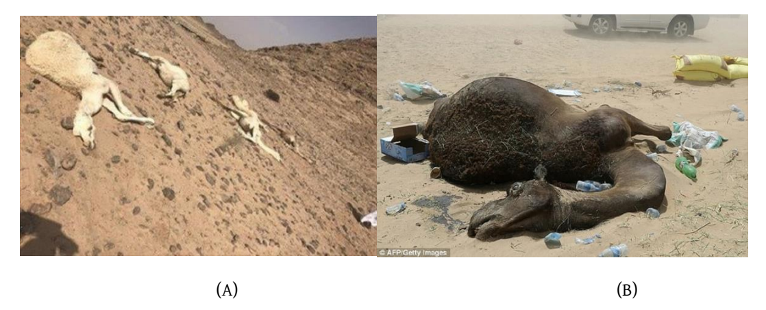
Figure 1. A) Baby camels shown dead (After Al-sharq: <a href="https://www.al-sharq.com/article">https://www.al-sharq.com/article</a>; B) Another dead camel (Daily mail Online http://www.dailymail.co.uk/news/article4682076/Qatari-camels-die-kicked-farms-Saudi.html)

Approximately, 10,000 camels arrived in Qatar on the 20th of June 2017. On the Qatari borders, Qatari government supplied water tanks and trucks carrying grass to feed the camels. Qatar's Ministry of Municipality and Environment (MME) had apportioned temporary shelter in South Kasarat Al Nakhash for approximately 8,000 camels and 5,000 goats and sheep. In celebrating the 7th Hamad Bin Khalifa symposium on Islamic Art titled: "Past, Present, and Future of Islamic Art", Her Highness Mrs Sheikha Al Mayassa's presentation (Fig. 2) referred to the following<sup>31</sup>: