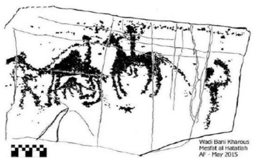
Figure 2.a-b. Photo and tracing of riders on horse and camels, Wadi Bani Kharous (after Fossati, 2017, permit from MAA journal, <a href="https://www.maajournal.com">www.maajournal.com</a> by the Editor-in-Chief)

In the late 1950s and early 1960s, a Danish archaeological mission were working in Qatar<sup>20</sup>, and in 1961, at the site of Al-Mazroaa, 23 kilometers south-west of Doha in Qatar, they discovered in grave 158.N remains of camel skeleton, in a good state of preservation, as well as human skeletons, pot sherds and fragments of bronze, iron and glass. The camel's position is as if he was resting on his knee, in a sitting position. It's neck is facing the northwestern part of the tomb wall, and the head lay with the bottom jaw up and the forehead laying on the left of the tomb<sup>21</sup>. Urepmann and Urepmann (2012) stated that its bones combined the strength of two-humped camel and the speediness of one-humped camel. Skeletons of camels were found in graves in the Arabian Peninsula at for example Mleihe, Sharjah, UAE dating between 1st century BC and the 1st century AD<sup>22</sup>. The camel was believed to have been led alive to the tomb to be buried next to his owner. The camel was placed alive in a seated position and its neck was pulled back until it died<sup>23</sup>.