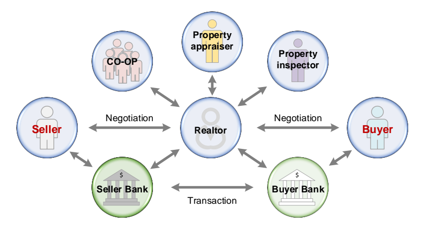
Fig. 2: An Illustration of the Traditional Real Estate Ecosystem